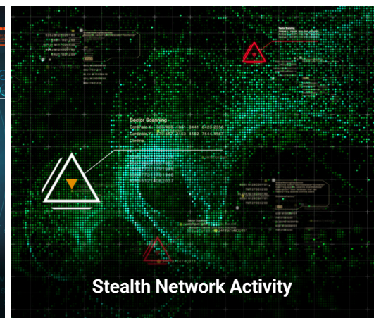
Stealth Network Activity

Low profile software client offers assured connectivity for sensors, autonomous vehicles and weapons systems.