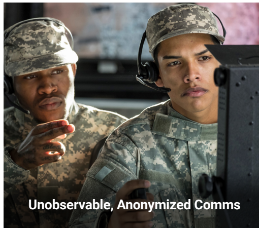
Unobservable, Anonymized Comms

Conceals end user identity, hides identifiable patterns of communication, resists detection and blockage.