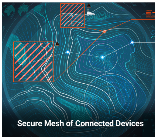
Secure Mesh of Connected Devices

Agile installations for field operations, creating secure remote connections in contested network environments.